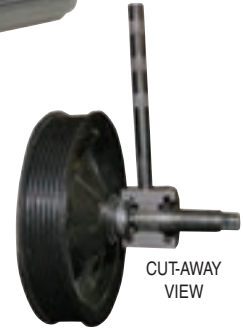
U.S. Pat No. 7,007,359