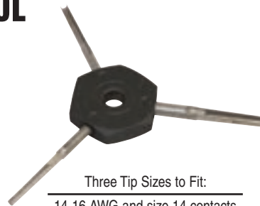
Three Tip Sizes to Fit:

59600 Deutsch Terminal Tool. Skin-packed. Shipping wt. 2 oz.