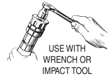
USE WITH WRENCH OR IMPACT TOOL