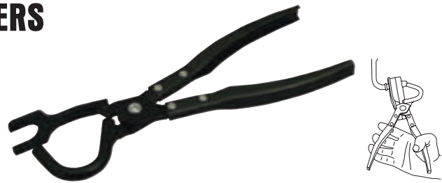
U.S. Pat No. D495,225

38350 Exhaust Removal Pliers. Skin-packed. Shipping weight 1 lb. 3 oz.