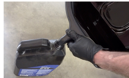
SPOUT DESIGN FITS MOST JUGS