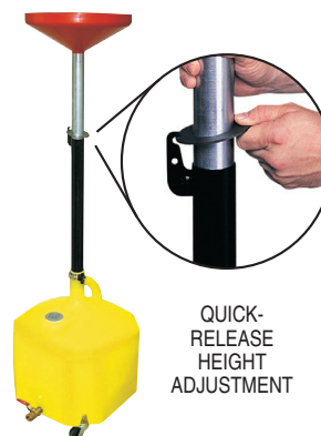
QUICK-RELEASE HEIGHT ADJUSTMENT