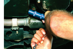
TAPPING DRAIN HOLE