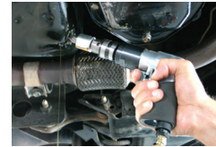
DRILLING DRAIN HOLE