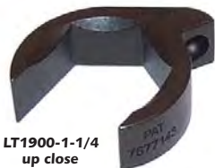
LT1900-1-1/4 up close