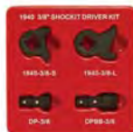
LT1940-3/8 includes - 3/8" Short Throw Shockit Driver 3/8" Long Throw Shockit Driver 3/8" Low Profile Drive Plug 3/8" Drive Plug Breaker Bar