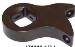
LT1940-1/2-L up close

Scan QR code or search LT1940 on YouTube to see tool work!