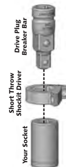
Short Throw Shockit Driver Drive Plug Breaker Bar Your Socket