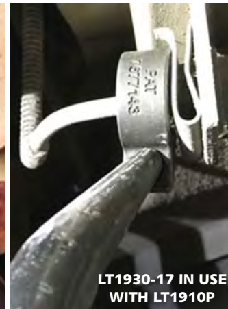
LT1930-17 IN USE WITH LT1910P