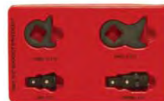
LT1940-1/2 includes - 1/2" Short Throw Shockit Driver 1/2" Long Throw Shockit Driver 1/2" Low Profile Drive Plug 1/2" Drive Plug Breaker Bar