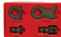
LT1940-3/4 includes - 3/4" Short Throw Shockit Driver 3/4" Long Throw Shockit Driver 3/4" Low Profile Drive Plug 3/4" Drive Plug Breaker Bar