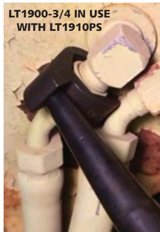
LT1900-3/4 IN USE WITH LT1910PS