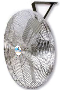
Non-Oscillating Vertical Mount