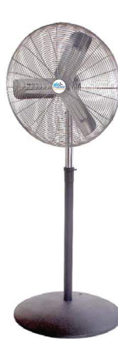
Adjustable Floor Model Solid Base