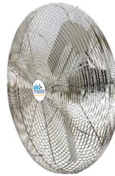
Non-Oscillating Head Assembly

Motor, Guard, and Propeller pre-assembled