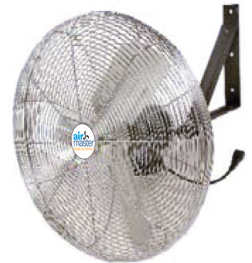
Non-Oscillating Wall Mount