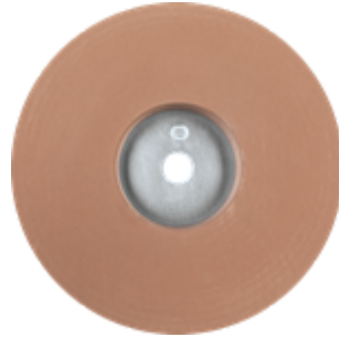
A-69048 Grinding Wheel, 1,000 Grit (Medium)