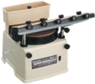
98202 Blade Sharpener