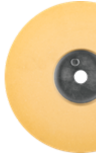
A-69054 Grinding Wheel