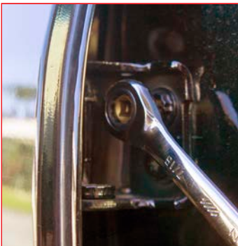
GREAT FOR TIGHT SPACES

All bit sets feature a convenient color coded storage rail that keeps them organized and easily identified and ready for use.