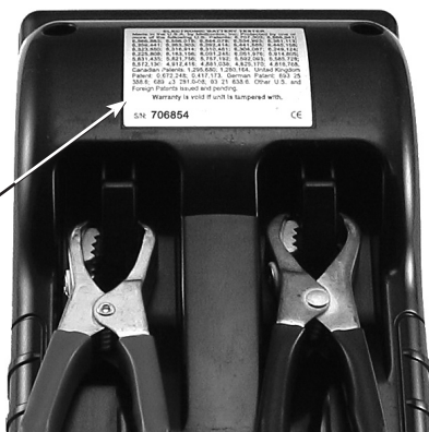
Serial Number Label