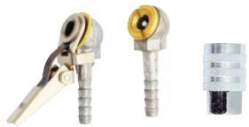
694 695 s-696