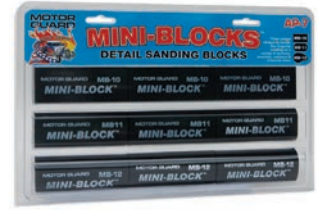
AP-7 Mini-Block Assortment

Flexi-Blocks™ are available in three styles, the Rectangular Flexi-Block (FB-1) for flat sanding and sharp corners, the Double D Flexi-Block (FB-2) with radiused sides for sanding inside contours, and the Curved Flexi-Block (FB-3) for complex body lines and details. The blocks are also offered in a see-through pegboard display of all three, the AP-6 Flexi-Block™ Assortment.