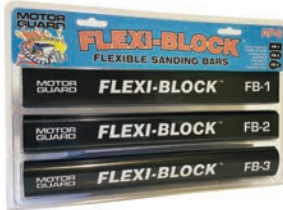
AP-6 Flexi-Block Assortment

These new miniature sanding blocks are designed for fine detail sanding in tight spaces. Constructed of a specially formulated compound, their ergonomic shapes allow for fine, fingertip sanding on a wide variety of profiles and body lines. Each bar measures 3-1/2 inches in length.