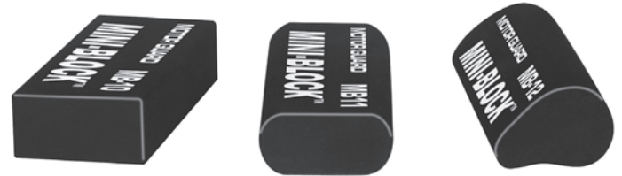
MB-10 - Rectangular Mini-Block MB-11 - Double-D Mini-Block MB-12 - Curved Mini-Block