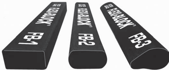
FB-1 - Rectangular Flexi-Block FB-2 - Double-D Flexi-Block FB-3 - Curved Flexi-Block

Mini-Blocks™ are available in three styles, the Rectangular Mini-Block (MB-10) for flat sanding and sharp corners, the Double D Mini-Block (MB-11) with radiused sides for sanding inside contours, and the Curved Mini-Block (MB-12) for complex body lines and details. The blocks are also offered in a see-through pegboard display of all three, the AP-7 Mini-Block™ Assortment.