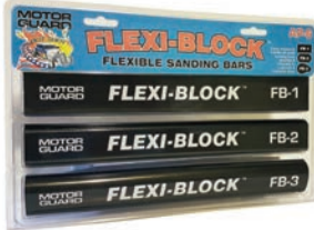
AP-6 Flexi-Block Assortment

These new miniature sanding blocks are designed for fine detail sanding in tight spaces. Constructed of a specialty formulated compound, their ergonomic shapes allow for fine, fingertip sanding on a wide variety of profiles and body lines. Each bar measures 3-1/2 inches in length.