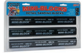
AP-7 Mini-Block Assortment

Flexi-Blocks™ are available in three styles, the Rectangular Flexi-Block (FB-1) for flat sanding and sharp corners, the Double D Flexi-Block (FB-2) with radiused sides for sanding inside contours, and the Curved Flexi-Block (FB-3) for complex body lines and details. The blocks are also offered in a see-through pegboard display of all three, the AP-6 Flexi-Block™ Assortment.