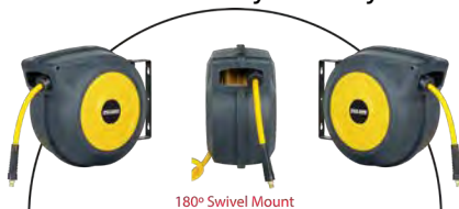
180° Swivel Mount