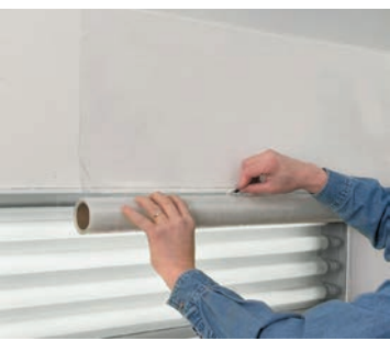
Using a SNIPPET KNIFE or razor blade, cut across film at top edge of lightbox. (Do NOT cover lightbox*.)