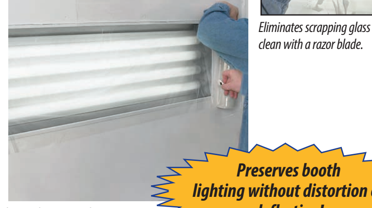
Finishing up at end of glass and cutting with SNIPPFT KNIFF or razor blade.