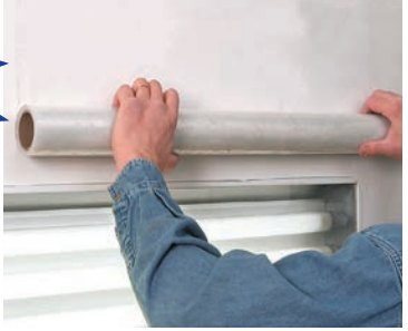
Roll down film against wall smoothing as you go to the top of lighthox