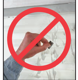
Eliminates scrapping glass clean with a razor blade.