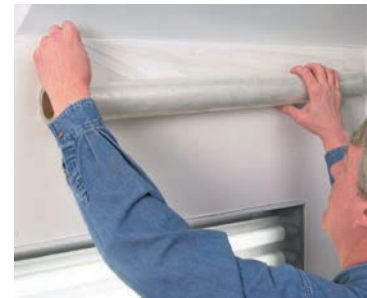
Beginning at one end of the wall, tack down a 2"-3" starter edge at the ceiling break.

Do NOT apply over Lite Box Glass. (Adhesive system is designed for walls only.) Use No. 435 Lite Box Glass Film.