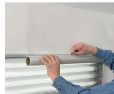
Using a SNIPPET KNIFE or razor blade, cut across film at top edge of lightbox. (Do NOT cover lightbox*.)