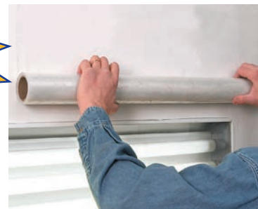
Roll down film against wall smoothing as you go to the top of lightbox.