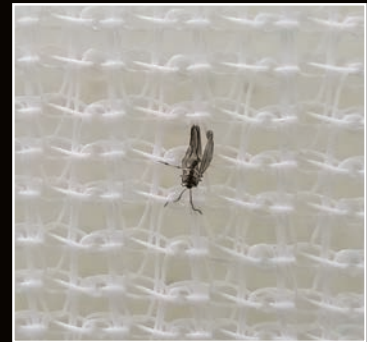
Bug trapped in netting.