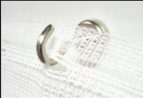
Easy to install (like a shower curtain). Just hook netting thru eyelets.