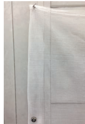
After cutting netting fold over and secure with magnets for a clean edge.