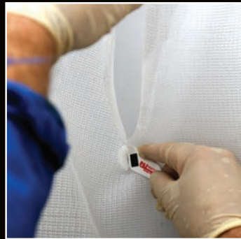
Cutting the netting is easy. Just use the #555 RBL snippet cutter blade.