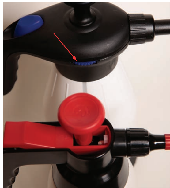
RBL Heavy Duty Pressure Sprayer has pressure relief. Competition does not.