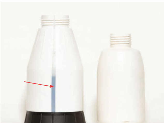
Larger capacity fluid volume with viewing window. Competition is smaller capacity and no viewing window