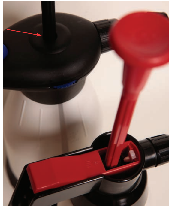
Open top design allows debris to enter. RBL Heavy Duty Pressure Sprayer is completely enclosed.