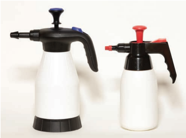
RBL Heavy Duty Pressure Sprayer