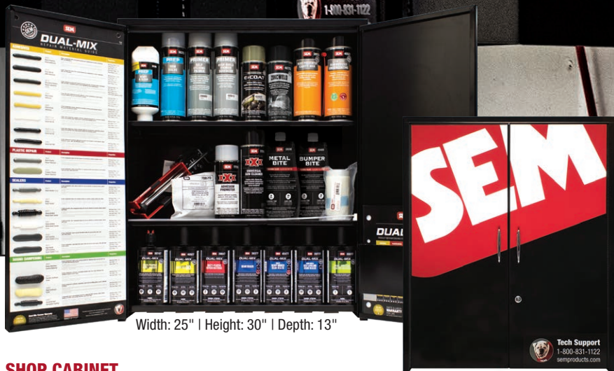
Width: 25" | Height: 30" | Depth: 13"