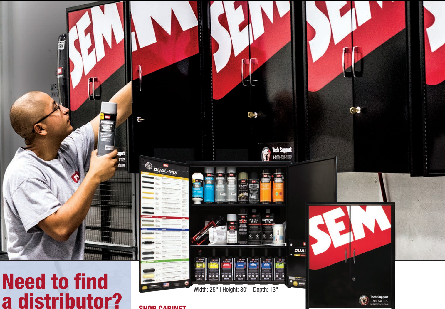
Width: 25" | Height: 30" | Depth: 13"