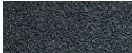
Light texture with drop coat

Note: When utilizing any rubberized undercoating product over 1K coatings, softening or separation may occur. Test in an inconspicuous area for compatibility.