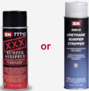
77713 XXX BUMPER STRIPPER or 39913 URETHANE BUMPER STRIPPER