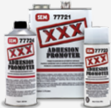
3986( ) PLASTIC ADHESION PROMOTER or 7772( ) XXX ADHESION PROMOTER