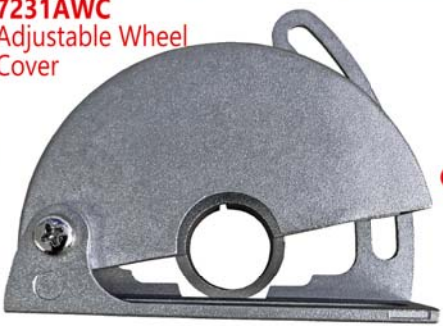
7231AWC Adjustable Wheel Cover