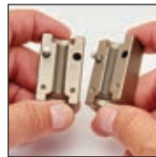
Pins ensure accurate alignment of dies