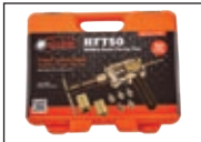
HFT50 HYDRA-Assist Flaring Tool