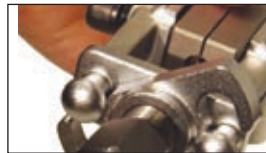
S-Lock for Quick Assembly

Lightweight and Compact for Easy Operation