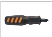
RM69 Brake Tubing Reamer