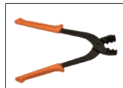
TP14316 Tubing Pliers