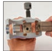
Magnetic yoke holds dies securely in place