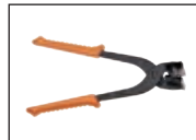
TS14316 Tubing Straightener & Bending Pliers