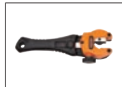
TC60 Automatic Ratcheting Tubing Cutter