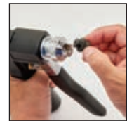
Detent ball provides quick punch change

Create Virtually Any Flare Instantly (Applies to PFT409 and HFT 50)