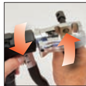
Two-piece design allows for swivel action