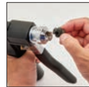
Detent ball provides quick punch change