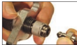
Quick Chuck for Fast Punch Changeover