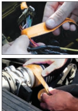
Used on auto, truck, RV, off road vehicles and more