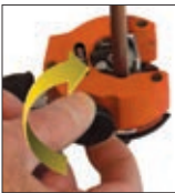
Cut tubing to desired length