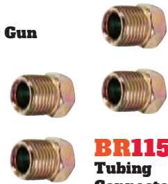
BR1150 Tubing Connectors