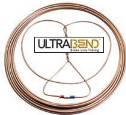
BR-EZ200 UltraBEND® Tubing