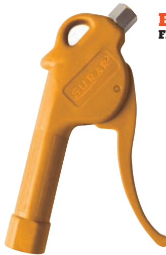
FA100 Flex Air Blow Gun