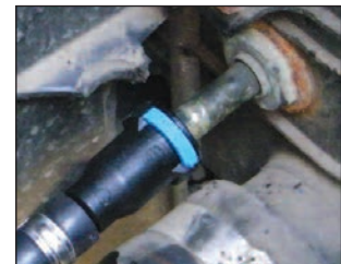
PROBLEM SOLVED With quick connect and new transmission line.