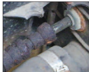
PROBLEM Leaking transmission line connector.