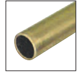
Deburred tubing is smooth, ready for flaring.