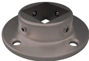
Use with FT351 Flaring Tool (see pg. 23)