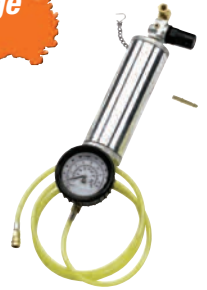
FIG201 Fuel Injection Cleaner Canister