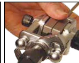
S-lock for quick assembly