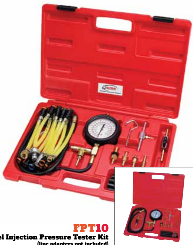
FPT10 Fuel Injection Pressure Tester Kit (line adapters not included)