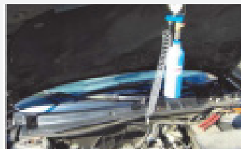
Easily connects to vacuum line