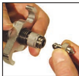
Quick chuck for fast punch change over.