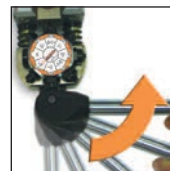
High-speed cam lever.