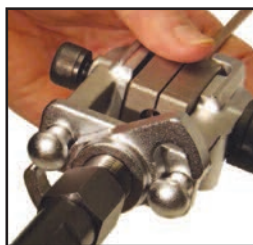
S-Lock for quick assembly.