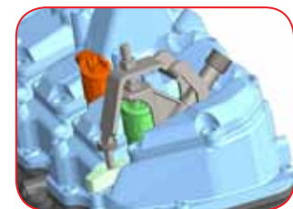
14 X 1.5 adapter