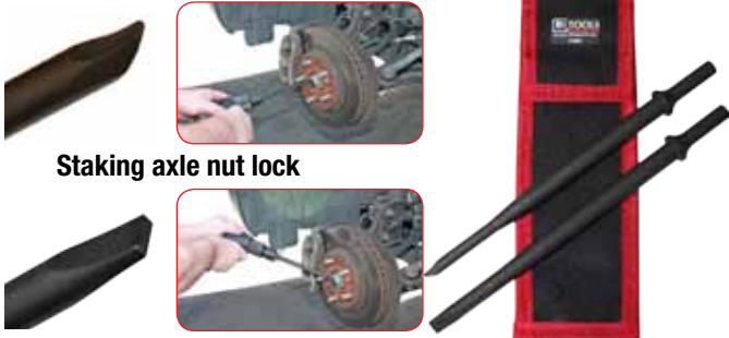
Staking axle nut lock