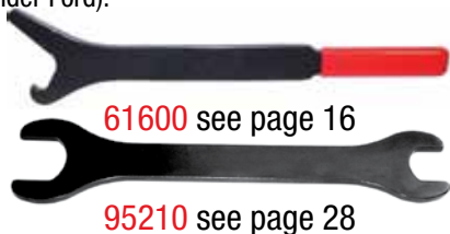
61600 see page 16

Applications: Chrysler, GM, Ford, Land Rover and Mazda (Not including the 4.9L 6 cylinder Ford).