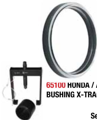
65100 HONDA / ACURA BUSHING X-TRACTOR™

65120 PATENT PENDING HONDA / ACURA BUSHING X-TRACTOR™ "REMOVAL AND INSTALLATION TOOL" Update for 65100, 65130