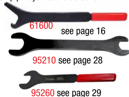
61600 see page 16

Applications: Chrysler, GM, Ford, Land Rover and Mazda applications. (Includes the 4.9L 6 cylinder Ford). Used on water pump pulleys that are bolted-on