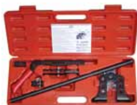
91400B UPDATED UNIVERSAL OHC VALVE SPRING COMPRESSOR