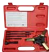
13450 DODGE HARMONIC DAMPER PULLEY PULLER