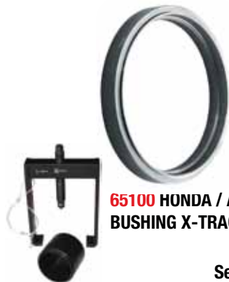
65100 HONDA / ACURA BUSHING X-TRACTOR™

65120 PATENT PENDING HONDA / ACURA BUSHING X-TRACTOR™ "REMOVAL AND INSTALLATION TOOL" Update for 65100, 65130