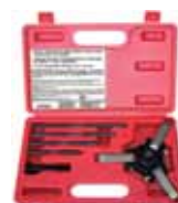
64900A UPGRADED HARMONIC DAMPER PULLEY PULLER KIT