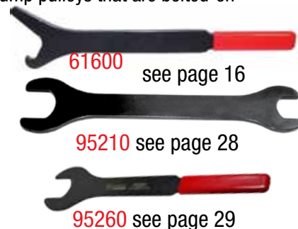
61600 see page 16

Applications: Chrysler, GM, Ford, Land Rover and Mazda applications. (Includes the 4.9L 6 cylinder Ford). Used on water pump pulleys that are bolted-on