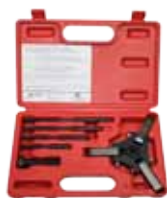
13350 CAMARO 3.6L HARMONIC DAMPER PULLEY PULLER