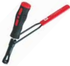
88950 UNIVERSAL VALVE ADJUSTMENT TOOL 10mm