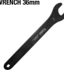
93260 FAN CLUTCH WRENCH 36mm