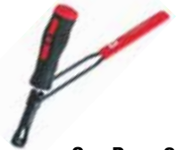
88800 UNIVERSAL VALVE ADJUSTMENT TOOL 12mm