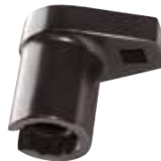
66750B SHIELDED OXYGEN & AIR FUEL SENSOR SOCKET