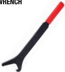
61600 FAN CLUTCH WRENCH