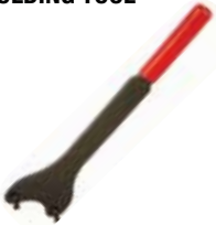
11500 CAMSHAFT PULLEY HOLDING TOOL