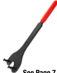
96800 CAMSHAFT PULLEY HOLDING TOOL