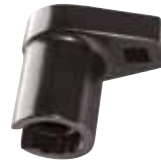
66750B SHIELDED OXYGEN & AIR FUEL SENSOR SOCKET