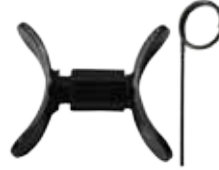
97300 TIMING BELT TENSIONER