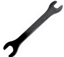
95210 FAN CLUTCH WRENCH 36mm & 48mm