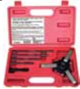
64900A UPGRADED HARMONIC DAMPER PULLEY PULLER