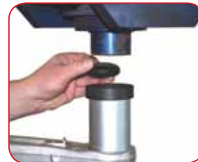
Removes and Installs