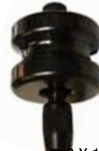
12 X 1.5 adapter

Developed for easy removal of injectors on all BMW's with direct injection. Simply screw the tool on to the top of the injector then, with 1 or 2 taps with slider, the injector will come out easily. This SP Tool is much more compact and easier to use than other injector pullers for BMW engines which greatly reduces the amount of time to replace injectors making more profit for technicians.