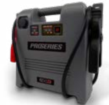
DSR119 Available in USA and Canada EN FR SP