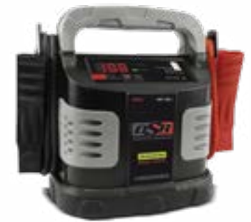
DSR132 Available in USA and Canada EN FR SP