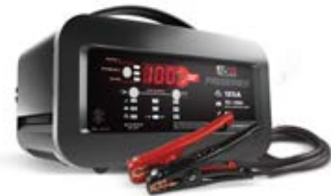
DSR145 Available in USA and Canada EN FR SP