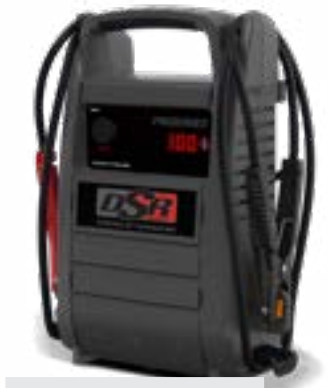
DSR141 Available in USA and Canada EN FR SP