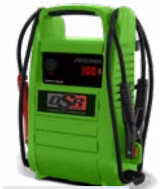
DSR141G Available in USA and Canada EN FR SP