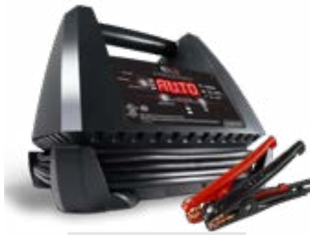
DSR118 Available in USA and Canada EN FR SP