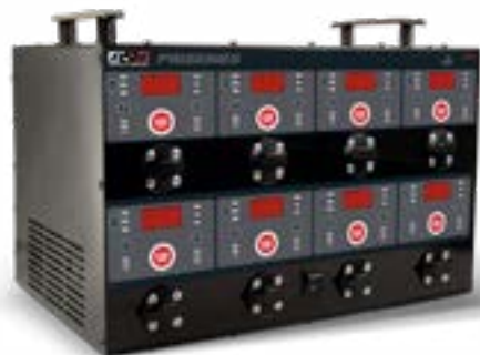
DSR127 Available in USA EN