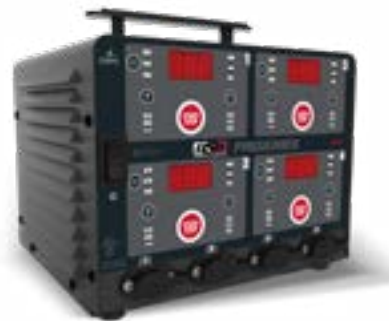
DSR125 Available in USA EN FR SP