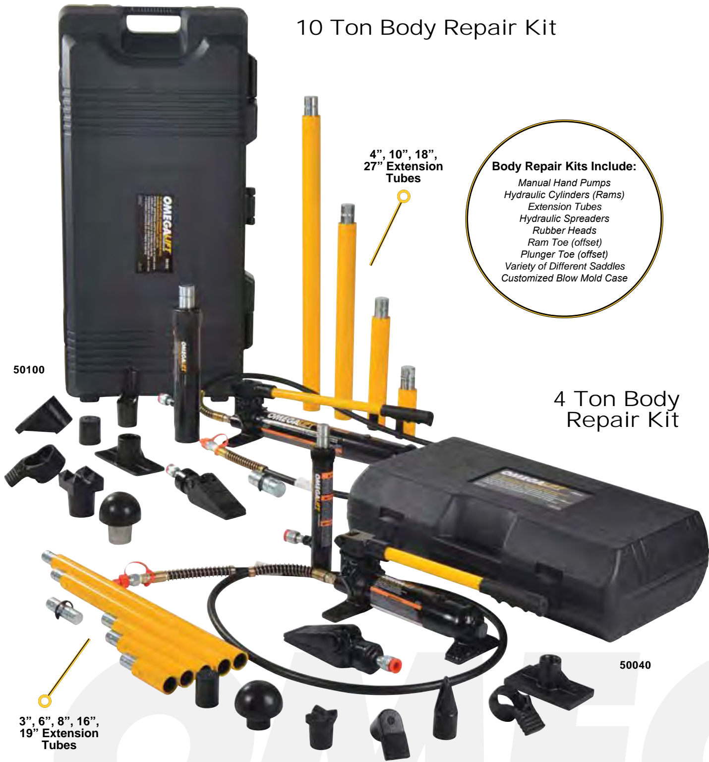
10 Ton Body Repair Kit