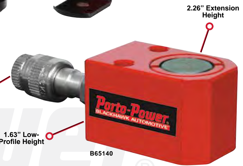
1/4" Male Coupler