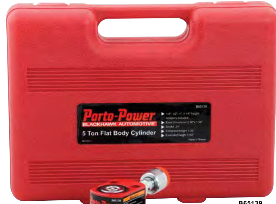
5 Ton Flat Body Cylinder