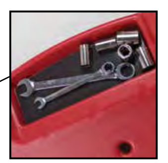
Magnetic tray keeps bits and parts in its place