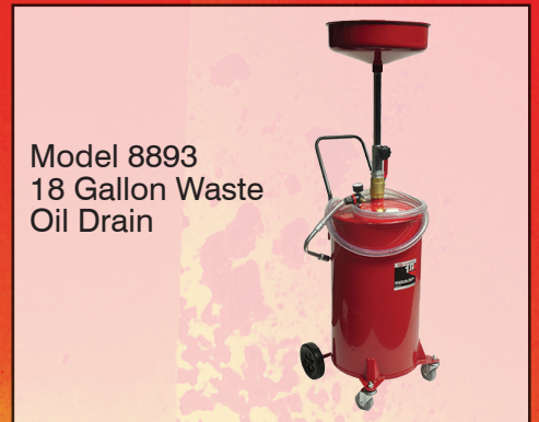
Model 8893 18 Gallon Waste Oil Drain