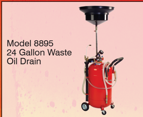
Model 8895 24 Gallon Waste Oil Drain