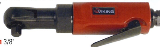
VT1100 1/4" | VT1101 3/8"

Mini Durable Ratchet Head / Variable Speed Throttle Provides Precise Control / Ball & Needle Bearing Construction for Long Life / Compact & Lightweight / 1/4 NPT Air Inlet / 90 PSI Maximum Pressure / 1 Year Warranty