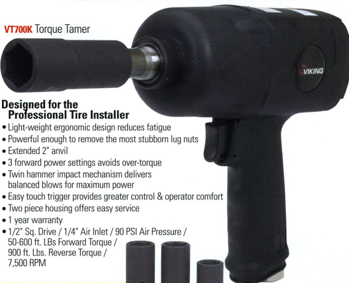
VT700K Torque Tamer