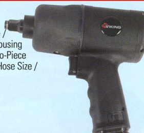
VT2200C 3/8" | VT2201C 1/2" | VT2202C 3/4"

Composite Heavy-Duty Twin Hammer Impact Mechanism Delivers Balanced Blows for Maximum Power / Three Power Settings in Forward / Maximum Torque in Reverse / Extra Strong, Lightweight Construction / Composite Material Housing with Rubber Coated Steel Hammer Case / Handle Exhaust / Two-Piece Housing for Easy Service / Easy Touch Trigger / 3/8" Minimum Hose Size / 90 PSI Maximum Pressure / 1 Year Warranty