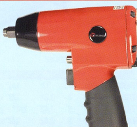
VT2100 3/8" | VT2101 1/2" | VT2102 3/4"

Professional 4 Positive Power Settings in Forward / Maximum Torque in Reverse / Durable Pin Clutch Impact Mechanism / Ergonomic Contoured Elastomer Handle Grip / Handle Exhaust / 360° Air Inlet Swivel (Except VT2100) / Push Button Forward & Reverse For Single Hand Operation / Easy Touch Trigger / 1/4 NPT Air Inlet / 90 PSI Maximum Pressure / 1 Year Warranty