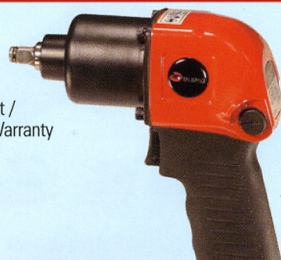
VT2200 3/8" | VT2201 1/2" | VT2202 3/4"

Heavy-Duty Twin Hammer Impact Mechanism Delivers Balanced Blows for Maximum Power / Adjustable Power Output in Forward & Reverse / Handle Exhaust / Two-Piece Housing for Easy Service & Operator Convenience / Easy Touch Trigger Provides Greater Control & Operator Comfort / 3/8" Minimum Hose Size / 90 PSI Maximum Pressure / 1 Year Warranty