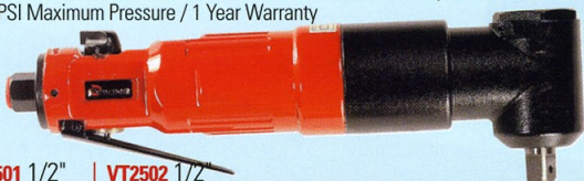
VT2500 3/8" | VT2501 1/2" | VT2502 1/2"

Angle Head Twin Hammer Impact Mechanism / Lever Throttle for Easy Operation / Adjustable Torque Settings in Forward or Reverse / One Piece Anvil is Manufactured of Alloy Nickel Chromium & Molybdenum Steel / 90 PSI Maximum Pressure / 1 Year Warranty