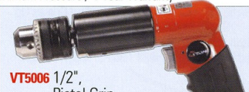
VT5006 1/2", Pistol Grip