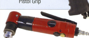
VVO408 3/8" Reversible Angle