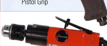
VT5003 3/8" Straight