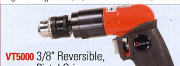
VT5000 3/8" Reversible, Pistol Grip

Pistol Grip, Straight & Angle One Hand Quick Reverse Lever (on reversible drills) / Elastomer Handle Grip (Pistol) / Heavy Duty Ball & Needle Bearing Construction / Planetary Gear Reduction Balances Drilling Load & Maximizes Performance / Precision Air Motor with Exceptionally High Turning Force / 3/8" Min. Hose Size / 90 PSI Maximum Pressure / 1 Year Warranty