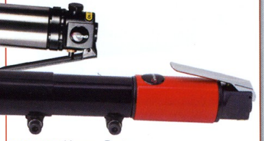
VNT1851 Heavy Duty

Needle Scaler Auto-Adjusts to Any Surface Contour / Cleans Welds, Castings, Brick, Stone Work, Concrete & Steel Plates / Heat Treated Barrels & Pistons / Chrome Vanadium SCM-4 Needles / 19 Needle (1.2" x 7") / 90 PSI / 1 Year Warranty