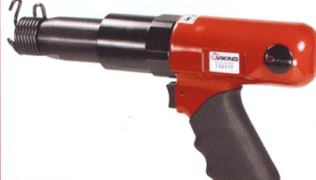
VT6006 Vibration Damped

Air Hammers Patented Vibration Dampening System / Easy Touch Trigger / Special Heat Treated Hardened Steel Barrel & Piston / Standard Spring Retainer / Elastomer Handle Grip / 3/4" Bore Size / 1/4 NPT Air Inlet / 3/8" I.D. Min. Hose / 90 PSI / 1 Year Warranty