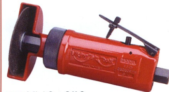
V325 Mini Cut-Off Saw

Circular Saw Adjustable Cutting Depths Capability / Lock-Off Safety Throttle / Heavy-Duty Motor & Geared Drive / Metal Blade Guard / Accepts 2" Capacity Blade / Light Weight / VT7502 - Ideal For Cutting Ferrous Metal / VT7503 - Ideal For Cutting Non-Ferrous Metal, Wood, Fiberglass And Composites / 1/4 NPT Air Inlet / 3/8" I.D. Min. Hose / 100 PSI Max. Pressure / 1 Year Warranty