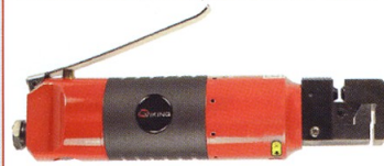
VT8510 Punch / Flange Tool

Punch / Flange Unique 2-in-1 Metal-working Tool / Head Swivels 360° / Insulated Handle / Comfortable Level Throttle / Crimps Up to 14 Gauge (.075") Sheet Steel or Punches Clean Holes (3/16") for Welding Applications / Muffled Handle Exhaust / 90 PSI Max. Pressure