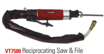
VT7500 Reciprocating Saw & File (One tool for both sawing and filing)

Reciprocating Saws Positive Blade Retention / Adjustable Guard Guide / Kick-Off Throttle & Built-In Regulator / High Performance Motor / 5,000 Strokes Per Minute / Rear Exhaust / Built-In Silencer / Light Weight, Slim Design / Safety Throttle Speed Lever / 16 Gauge Metal Capacity / 90 PSI Max. Pressure / 1 Year Warranty