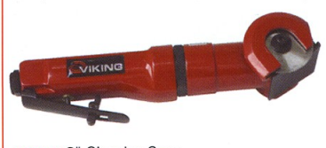
VT7503 2" Circular Saw

Circular Saw Adjustable Cutting Depths Capability / Lock-Off Safety Throttle / Heavy-Duty Motor & Geared Drive / Metal Blade Guard / Accepts 2" Capacity Blade / Light Weight / VT7502 - Ideal For Cutting Ferrous Metal / VT7503 - Ideal For Cutting Non-Ferrous Metal, Wood, Fiberglass And Composites / 1/4 NPT Air Inlet / 3/8" I.D. Min. Hose / 100 PSI Max. Pressure / 1 Year Warranty