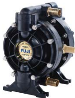
UDP5TA 13.2 GAL/MIN (50 L/MIN)