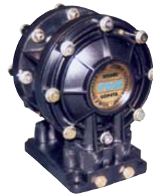
UDP4TA 3.7 GAL/MIN (14 L/MIN)