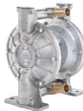
UDP6TA with optional stainless steel body 15.9 GAL/MIN (60 L/MIN)

Compact, reliable Uni-ram dual diaphragm pumps transfer many types of fluids used in industry including water based liquids, ink and solvents such as varsol and thinners. Fluids are used for many purposes including cleaning industrial parts and equipment. In this application, Uni-ram diaphragm pumps are ideal for transferring clean solvent to the cleaning site and returning used solvent to a reservoir.