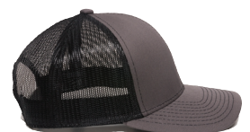
PRO ROUND (E)

It is either unstructured or lightly structured to lie closely to the head and is paired with a pre-curved visor.