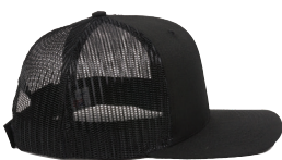
PRO HIGH (A)

It has a structured, steep profile and is typically featured with a flat visor.