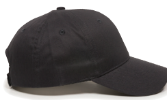
MID TO LOW (C)

Often thought of as the traditional baseball cap, it is usually structured, but has a slightly lower profile.