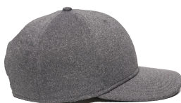
PRO MID (B)

It has a structured, steep profile and is typically featured with a flat visor.